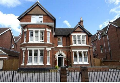
Elcombe House, Bedford