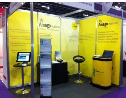
Bronze sponsor stand at the NCASC in London Excel

To learn more about the comprehensive capability of MyAmego or to arrange a meeting and a personal demonstration please contact: